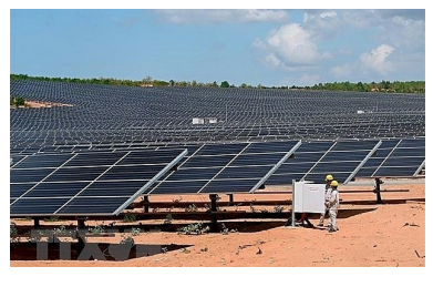
Solar power plant becomes operational in Ninh Thuan