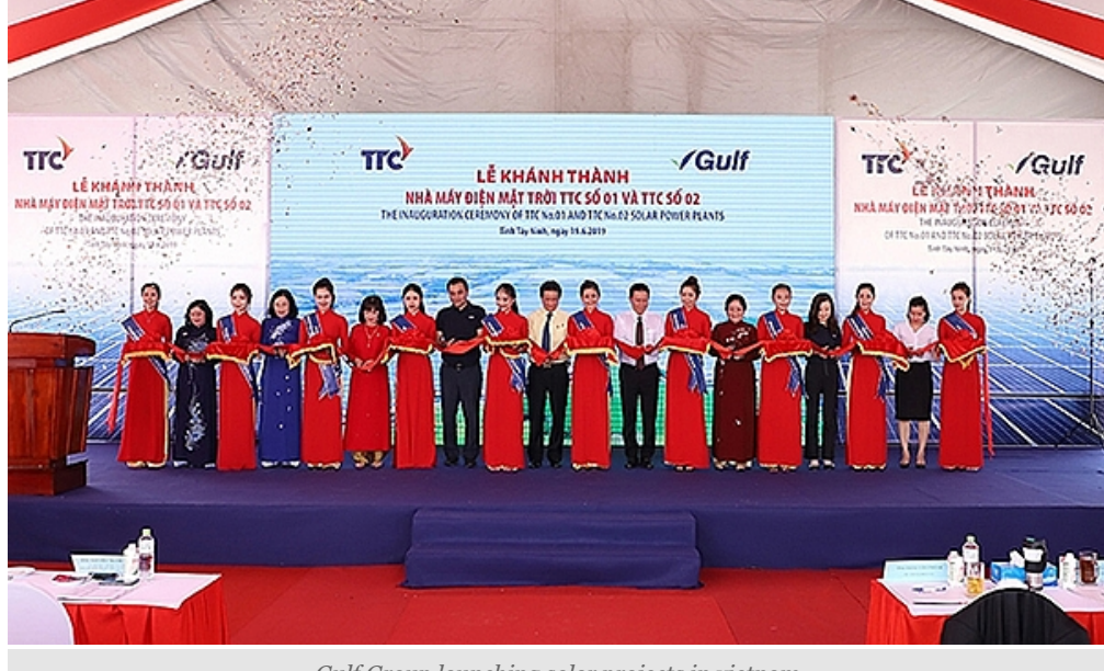
Gulf Group launching solar projects in vietnam

The solar power plants of Gulf Group will contribute to catching up with the trend of environmental protection, developing green and clean energy sources globally, while simultaneously dealing with the concerns of the domestic energy segment as coal, petroleum and hydropower resources have been fully exploited for a long time.