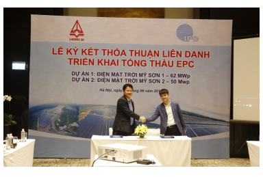
IPC joint venture becomes EPC contractor of two solar farms