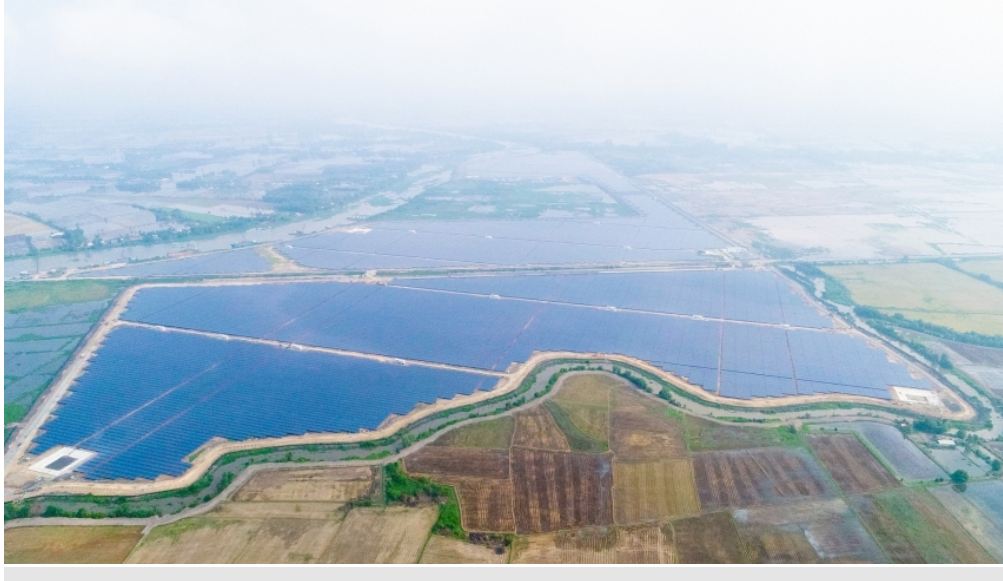
TTC No.01 and No.02 solar power plants in Thanh Thanh Cong Industrial Zone, Tay Ninh province

construction of ground leveling on August 10, 2018 with the total investment of approximately $50 million.