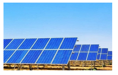
Indian company commissions solar plant in Vietnam